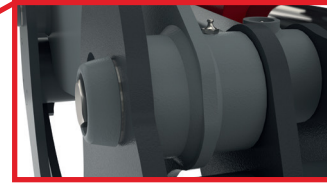
Perni conici montati su modello FLG 38 XS - FLG 53 XS / Conic pins mounted on models FLG 38 XS - FLG 53 XS